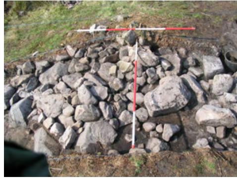
Cairn 2 with over burden removed