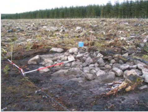
Cairn 1 with over burden removed

Massive boulders and slabs of sandstone up to 2m long and 1.5m square respectively lay apparently in natural repose, both on the surface of the sub stratum and embedded into it. Protruding through the underlying sand were the tips of other boulders and stones; some rounded, some tabular and some 'on end', but all typical of post glaciation's deposition. The same could be seen in many surrounding parts of the area.