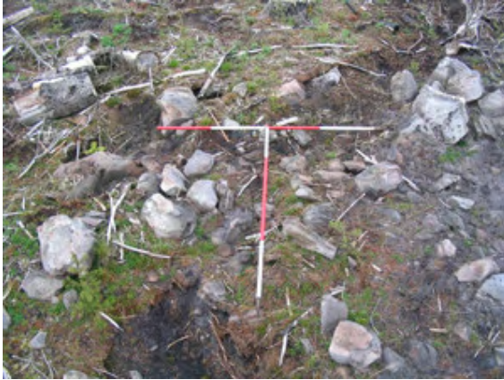
Cairn 3 showing disturbance prior to excavation.

The excavation of cairn 3 was more arbitrary, given the way it had been disturbed. An approximate trench of 3m by 2m was opened and this was aligned NW/SE. The cairn is assumed to have been about 3m in diameter by 0.5m high. The natural ground surface below the cairn was almost totally a bed of massive and large boulders. Three large boulders had been moved onto the pile and the rest of the cairn was similar to those already described. No artefacts were found here.