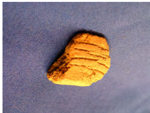
Cairn 1. The natural boulders left after the cairn stones were removed. Showing the lighter coloured sand in centre where the beaker sherd was found. The sherd is a base fragment with comb decoration.