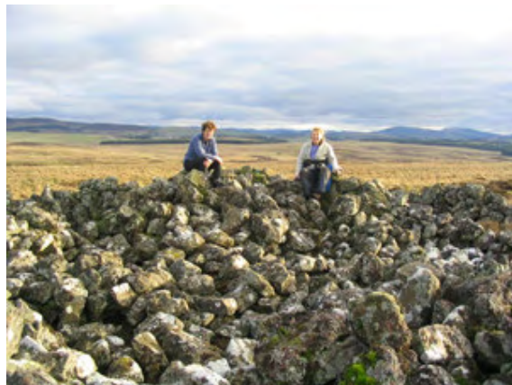
Burngrange Chambered Cairn and other nearby large cairn