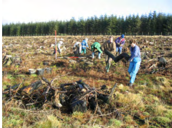
Typical disturbed cairn and burnt debris Clearing debris from excavation site

The cairn group (fig 2, Appendix III), which numbers forty three, and measuring up to 6m in diameter and no higher than 1m, lies in an area known as Hill Wood. The mature woodland was recently felled, and has now been re-planted and enclosed by a new protective fence. It is surrounded on the north, east and west sides by a plantation, which dates to c 1987 but is open to moor land on the south. The 1987 plantation area was subject to an archaeological field walking exercise already cited, when a significant lithic assemblage was retrieved; the artefacts were shown to embrace the Mesolithic, Neolithic and Bronze Ages.